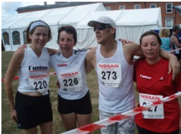
Our French running guests complete the race...

blazing sun could not do its worse and all runners – a record entry of 274 - completed the course without problems on the hydration/heat front. In fact St John Ambulance our first aid cover was not needed for any incident – not even a wasp sting! The second last minute emergency was resolved by the course marking team