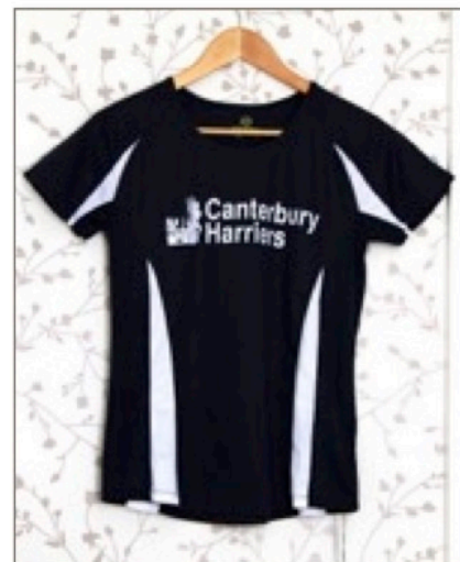
Ladies tech T-shirt