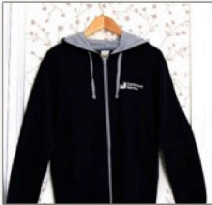
Full zip hoodie