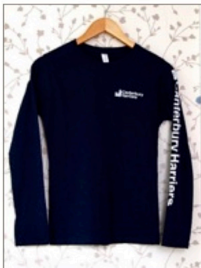
Long sleeve cotton