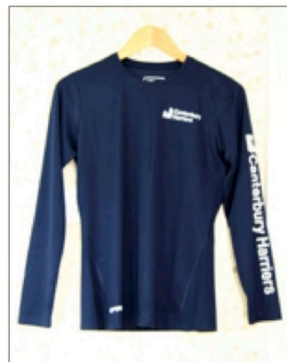
Long sleeve technical